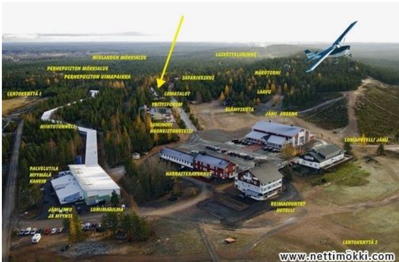
Jämi outdoor sport center area (civil airport/skiing tunnel)