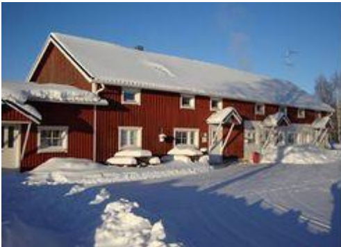
Countryside hotel in former animal shed

12.30 Lunch by Loma-Raiso- country tourism enterprise